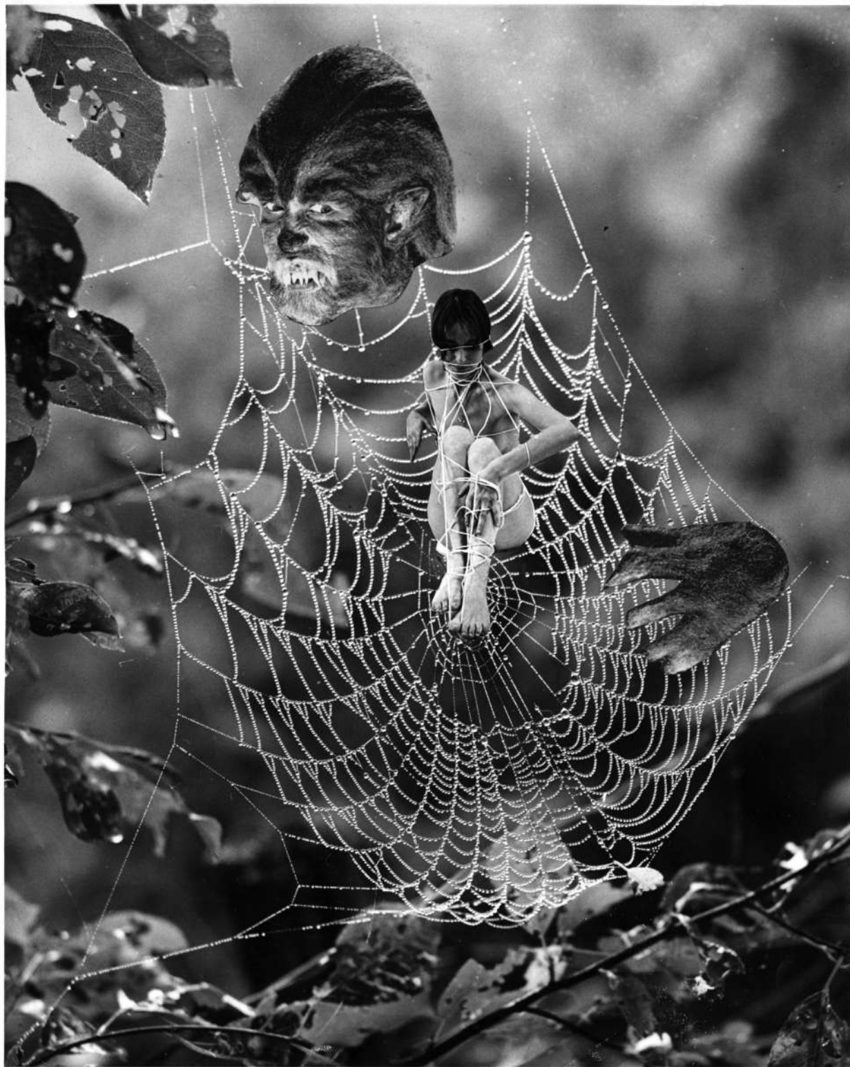
1 Penny Slinger, The Web (1973-74). Collage.