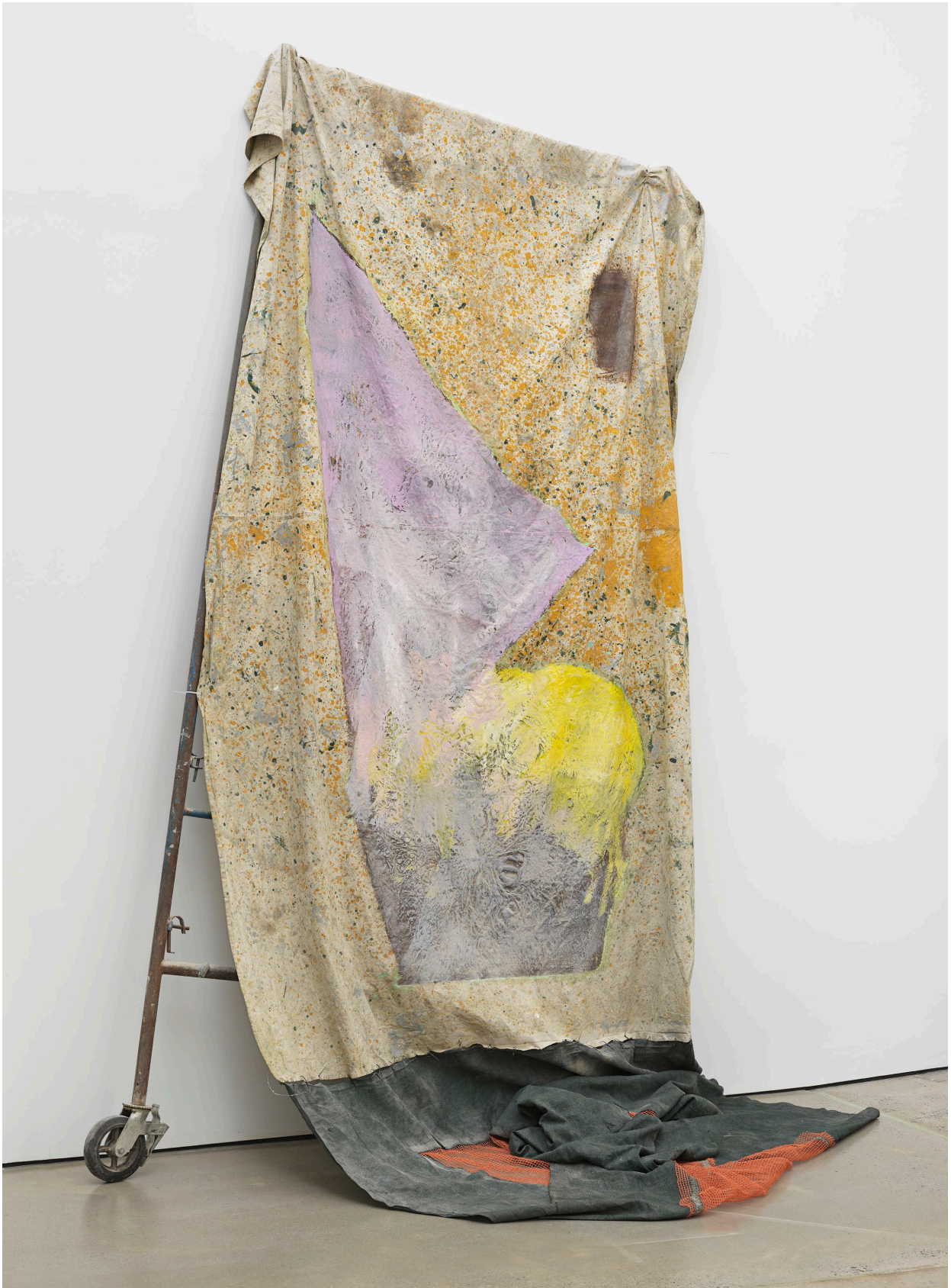
David Hammons, Untitled (2017). Mixed media.