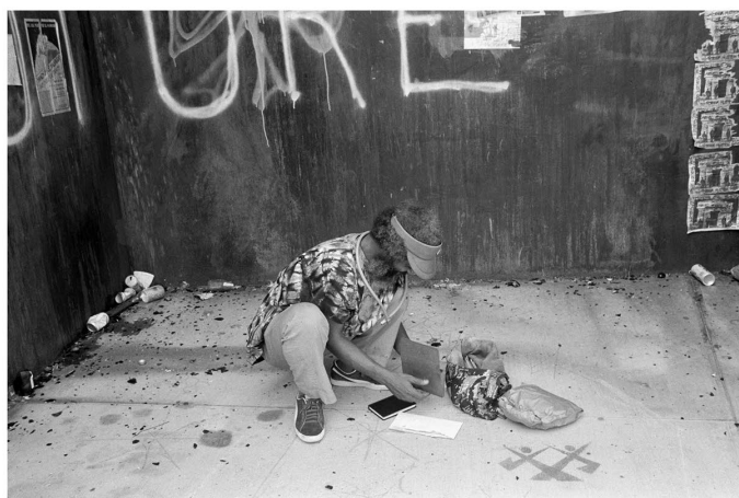
Dawoud Bey, David Hammons, Pissed Off (1981).