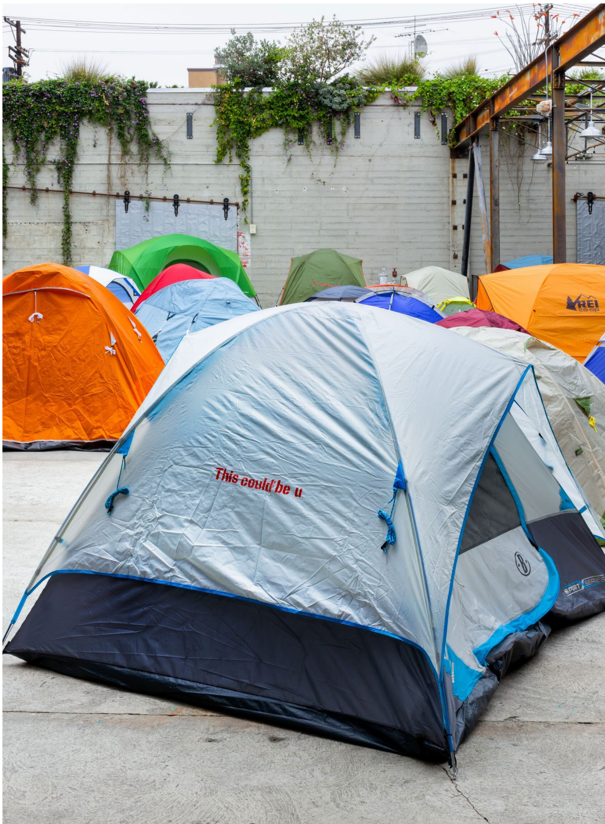
David Hammons (2019) (installation view). Image courtesy of the artist and Hauser & Wirth. © David Hammons. Photo: Fredrik Nilsen Studio.