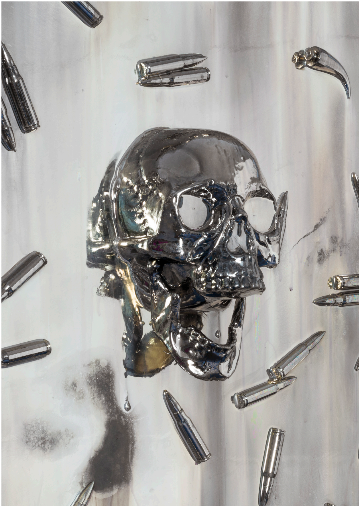
Mathieu Malouf, THE SCREAM (2019). Silver chroming process, AR15 bullets, and mixed media on linen on wood, 60 × 60 inches.