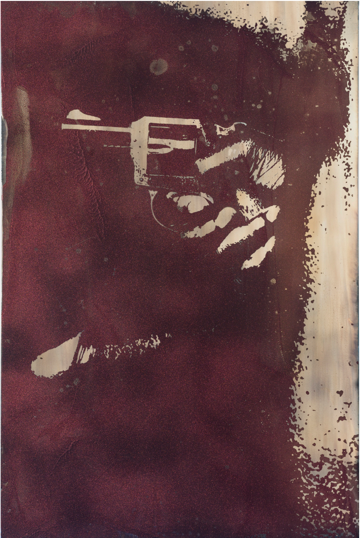
Mathieu Malouf, Deep Fried Portrait of Jesse Helms (2019). 4 color silkscreen process, plastisol, diamond dust on silver chromed epoxy resin on linen on wood, 60 x 40 inches.