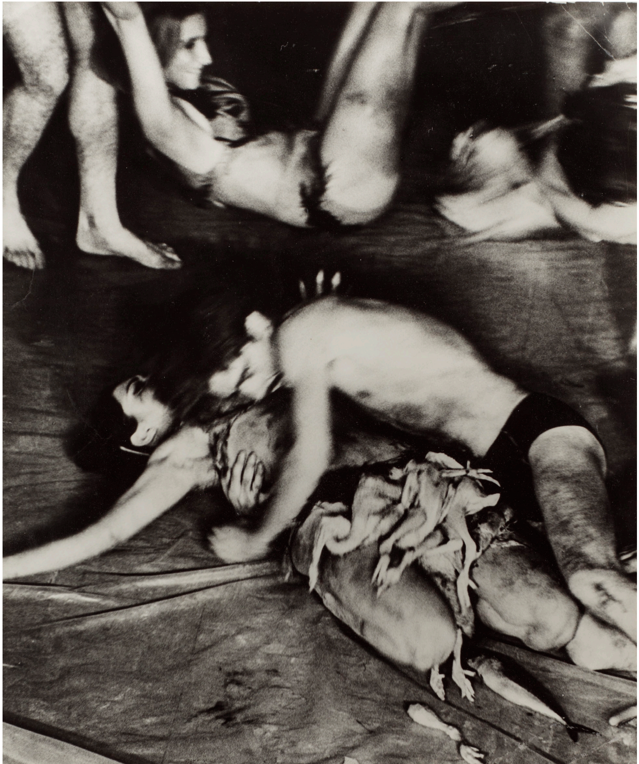
Carolee Schneemann, Meat Joy (1964). Silver print, signed, titled and dated on front, 23.75 x 20.25 inches. Image courtesy of the Estate of Carolee Schneemann, Galerie Lelong & Co., HalesGallery, and P•P•O•W, New York.