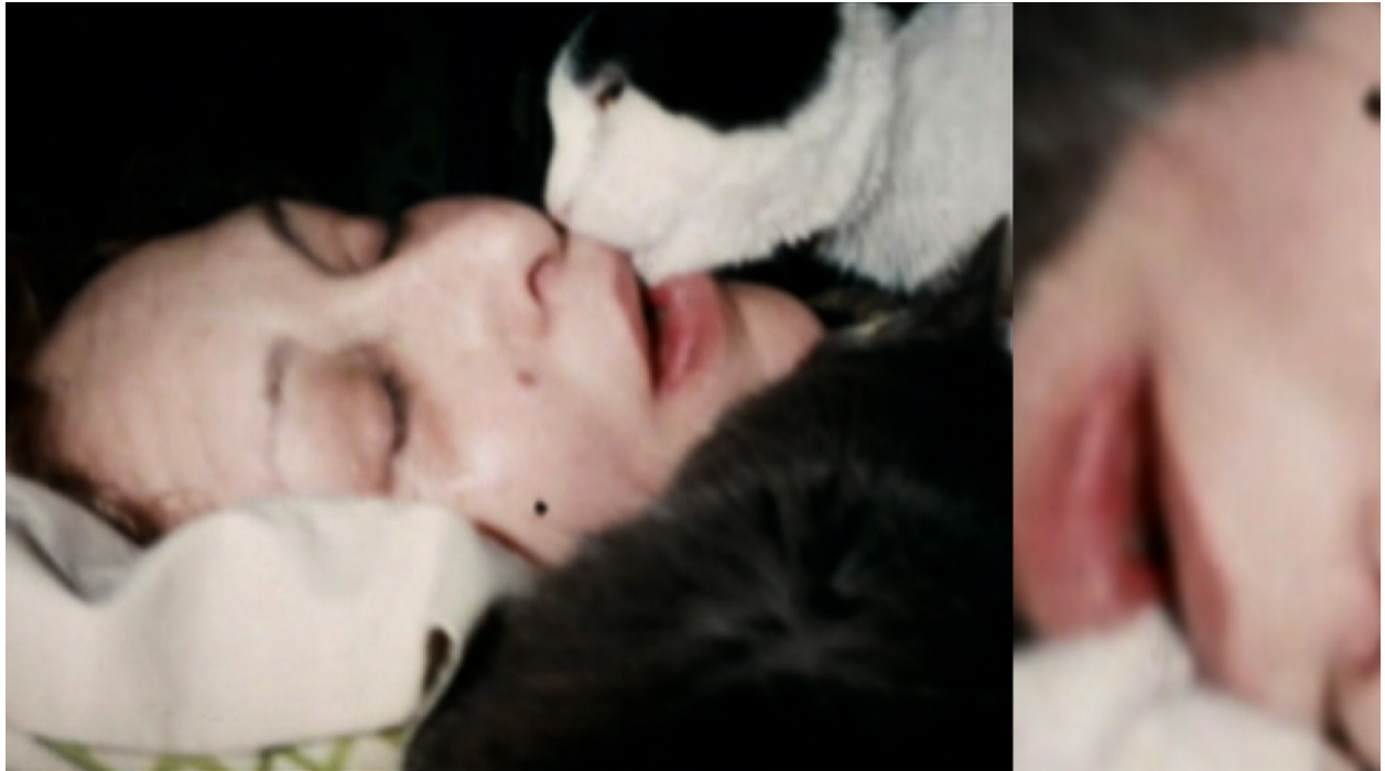
Above: Carolee Schneemann, Up to and Including Her Limits (1976). Gelatin silver print, 26.5 x 34 inches.